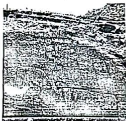
Figure 3(f): Example of fault